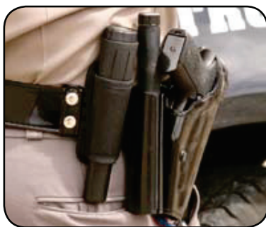
Ballistic weave holster (included) mounts easily on belt or in patrol car.